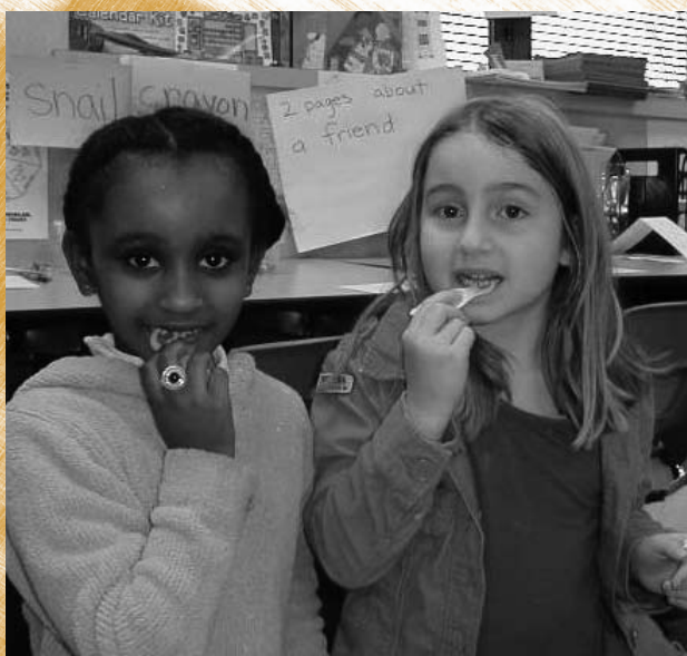
Top photo: preschoolers received free dental exams. Bottom photo: two of the Cooper Elementary School children who received holiday gifts from pediatric dentistry.

In addition, for children at local preschools, the department, through its predoctoral program, Dent 610, provided approximately 75 limited exams, cleanings, and fluoride applications.