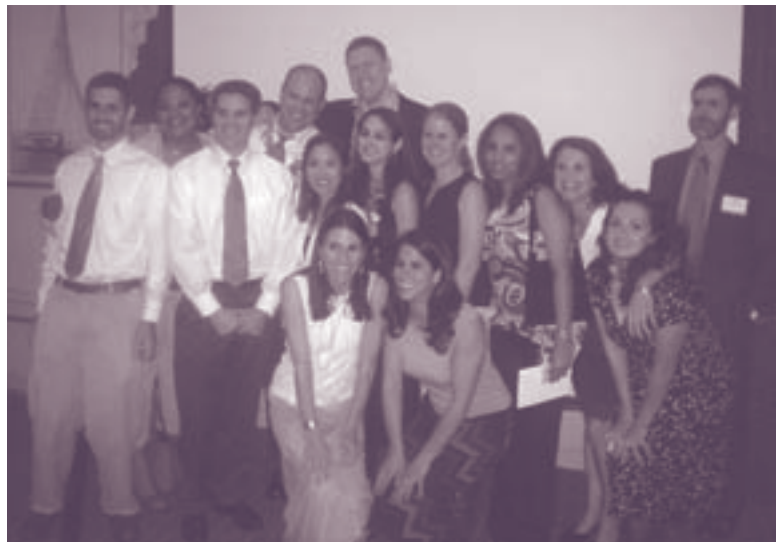
Keynote honoree director

Current and graduating residents gather with some clinic staff one last time at the gala.