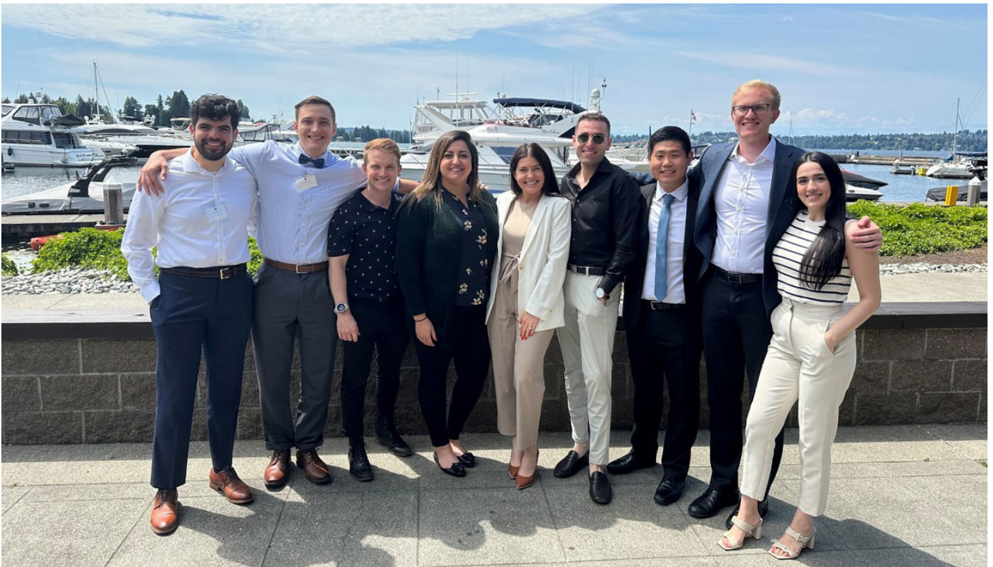
Top photo: 2025 and 2026 classes after completing Sprig zirconia crown training; bottom photo: 2023 and 2024 Graduates